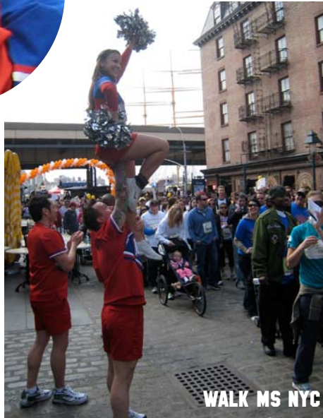
WALK MS NYC

If it's spring, you know where to find Cheer NY; in the parks and waterfronts of NYC cheering on generous New Yorkers showing up to fundraise! For example, CNY was in Central Park on May 17th to fire up and thank the crowd at AIDS Walk as they raised over $5.6 million for AIDS services and research. CNY also turned up at Manhattan's South Street Seaport on April 19th in support of Walk MS NYC, which raised $1.8 million for the National MS Society. Congratulations walkers!!! Cheer NY is proud of your efforts to help in the fight against debilitating diseases.