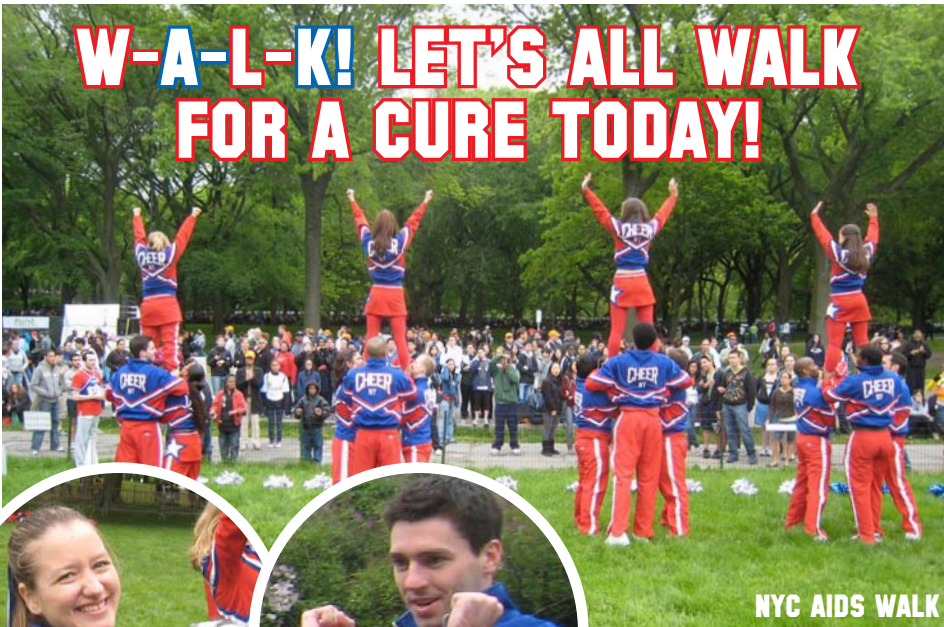
NYC AIDS WALK